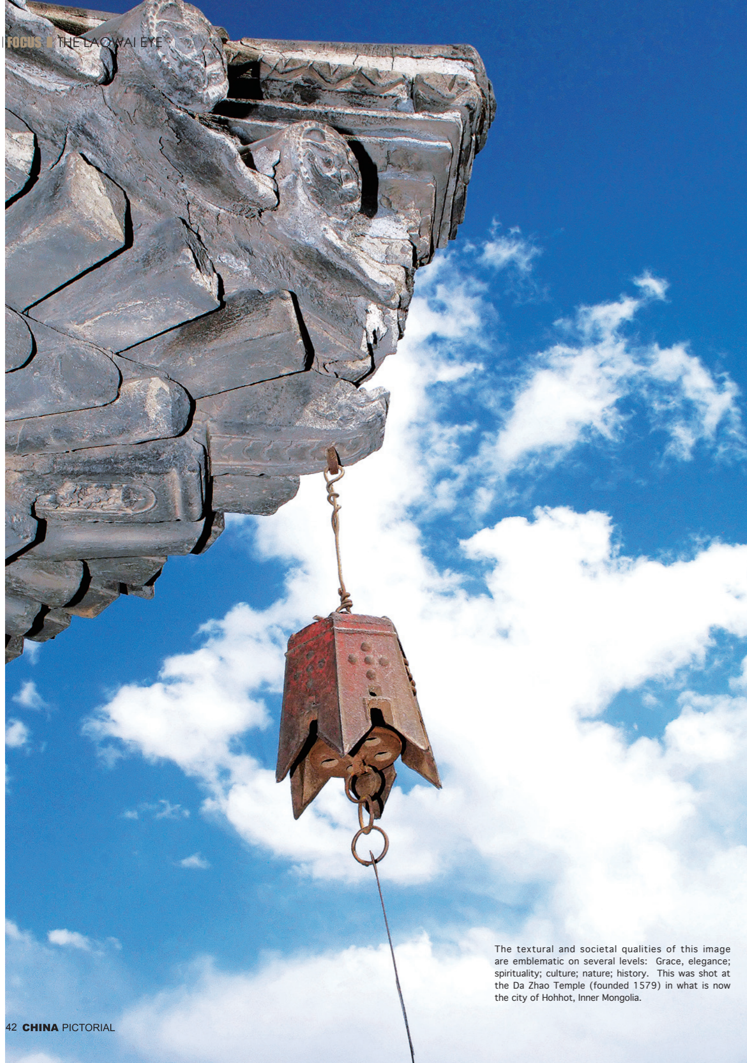
The textural and societal qualities of this image are emblematic on several levels: Grace, elegance; spirituality; culture; nature; history. This was shot at the Da Zhao Temple (founded 1579) in what is now the city of Hohhot, Inner Mongolia.